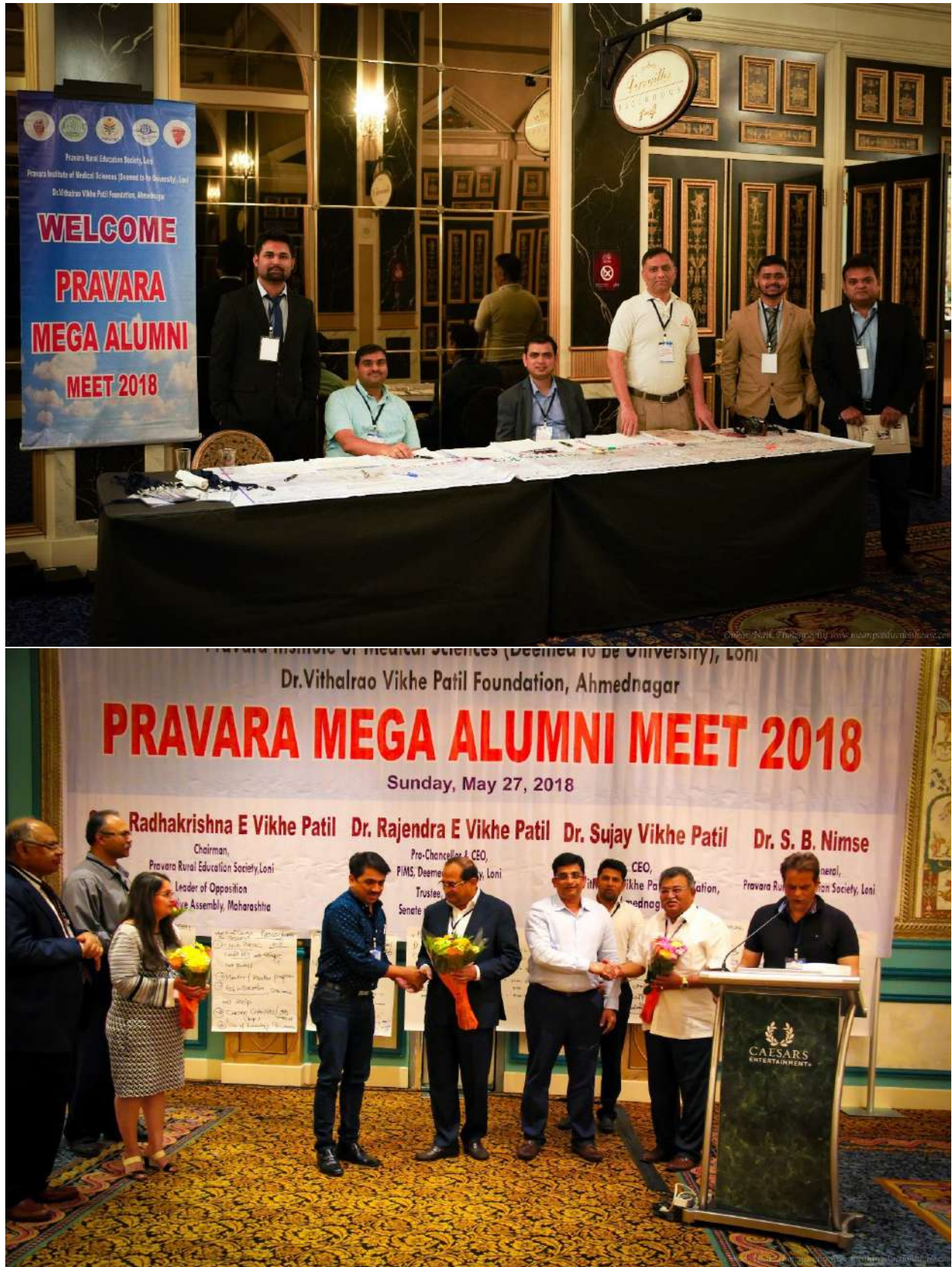
Glimpses of Las Vegas Alumni Meet