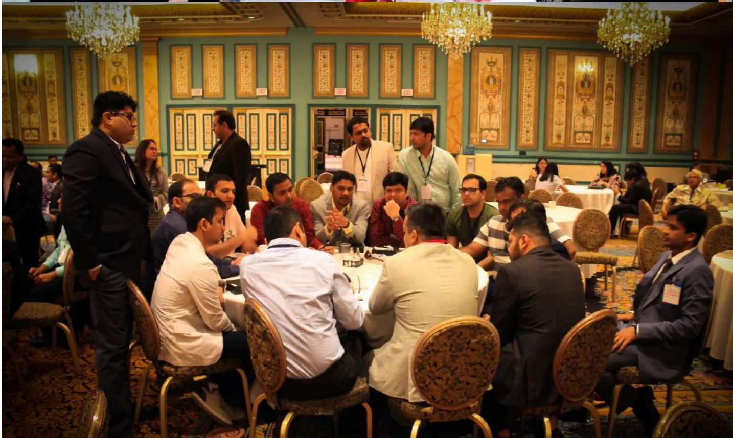
Glimpses of Las Vegas Alumni Meet