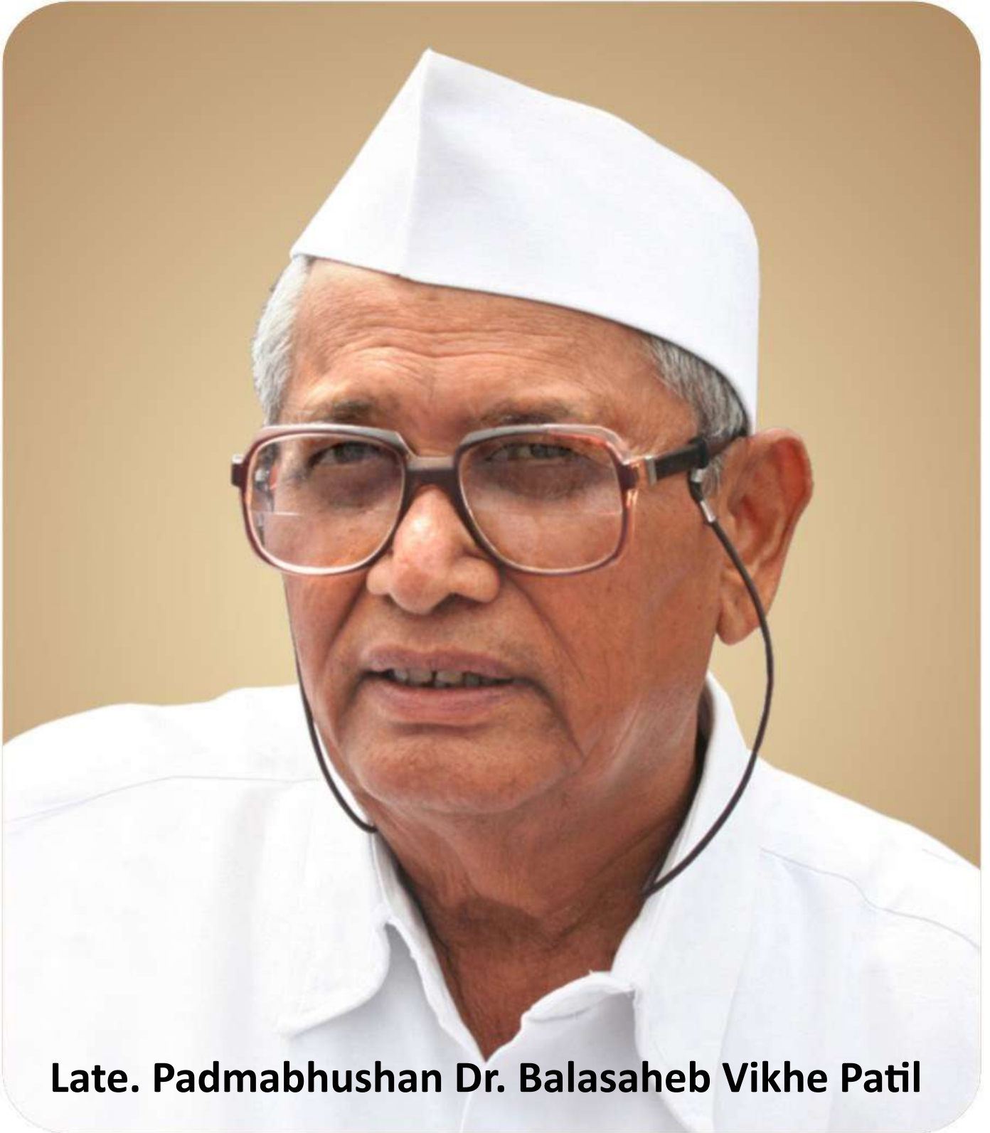
Late. Padmabhushan Dr. Balasaheb Vikhe Patil